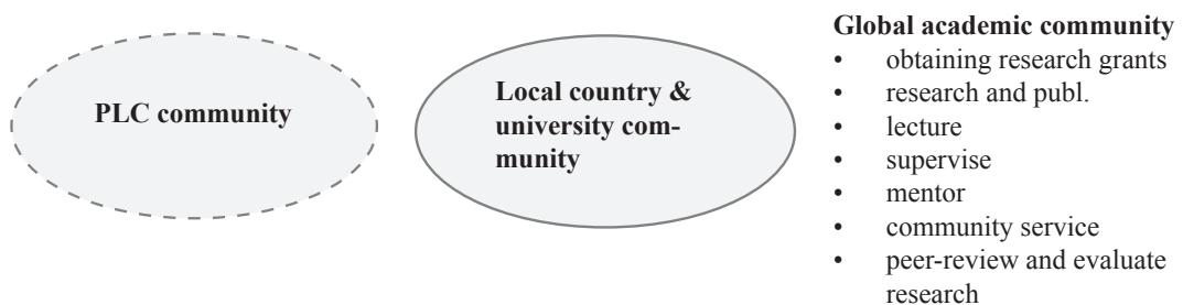
Figure 2: A sustainable academic community

Now, after 10 years, the PLC Community of Practice will dissolve (shown by the smallest oval in Figure 2) as it comes to the end of its funding period, but the sustainability designed into PLC could exist in other organisational formats, as shown in the adapted Figure 2. Both the supervisors and the PhD students who have graduated in their home countries will continue to work at their local universities (as shown by the inside oval in Figure 2) while also participating and contributing to the global academic community.