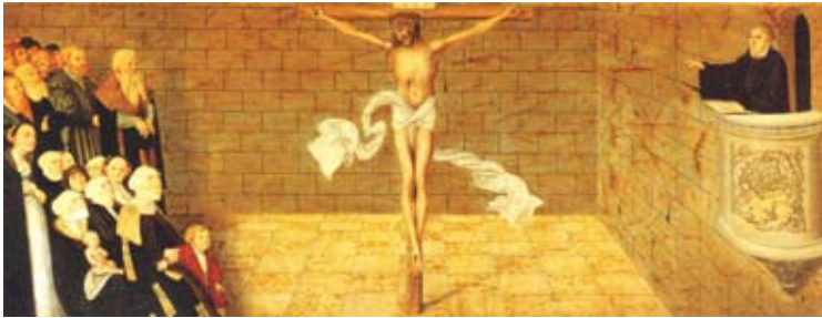
Figure 10: Lucas Cranach the Younger, Predella of altarpiece (1547). Wittenberg Christ Church (Koerner 2004: 258)

Lucas Cranach, a friend and supporter of Luther, is believed to have been influenced by Martin Luther in the design of the Altarpiece (1547) (Figure 9) he painted for the church in Wittenberg, the church of Luther's ministry where it still stands. The central panel and wings of the retable represent the last supper, baptism and confession. These "external signs of grace" are supported by another sign of grace: preaching, the subject of the predella underneath, which seems to "support" the rest of the retable (Koerner 2004: 76) (Figure 10).