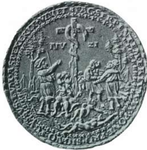
Figure 19: Plague medal, German (beginning of the sixteenth century). Silver (Schouten 1967: 98)

journey through the desert initiating the cult of Nohestan, after which king Hezekiah (2 Kings 18) reduced it to powder. This myopic and obsessive focus on the object itself is not unique in its history. The constant human struggle with the function of images as substitutes manifests again in the sixteenth century when plague medallions (Figure 19) with relief impressions of the brazen serpent on one side and of the crucified Christ on the reverse were struck in various cities in Germany (Schouten 1967: 101). As fetishistic amulets they served an apotropaic function to avert the evil of the plague.