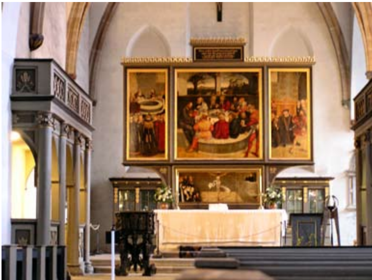
Figure 9: Lucas Cranach the Younger, Altarpiece (1547). Wittenberg Christ Church (Koerner 2004: 258)