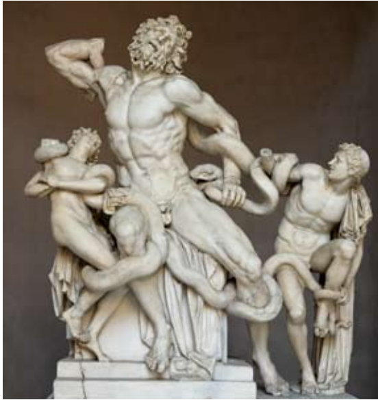
Figure 7: Anonymous, (Roman) after Greek original from c 300 BC, Laocoön and his sons (c AD 50) Marble. The Vatican Museum, Rome (Didi-Huberman 2001: 635).

In the mythic anthropocosmic experience of its original observers the sacred power of Poseidon was immediately significant in the terrible power of the snake. For modern beholders of the Laocoön sculptural group the god Poseidon, manifested in the mythic serpents, was dead, but reincarnated in the virtuosic creators of Renaissance art, like Michelangelo, Il Divino himself. Myth had lost its explanatory function through its demythologisation, but now reveals its exploratory significance or symbolic function as a new dimension of modern thought (Ricoeur 1967: 5). In Michelangelo's remediation of the pagan sculpture into a biblical mural painting we witness the artist's redefinition, the aesthetic demythologisation of the idol-status of sculptural representations of the gods of antiquity and their realignment as aesthetic exempla .