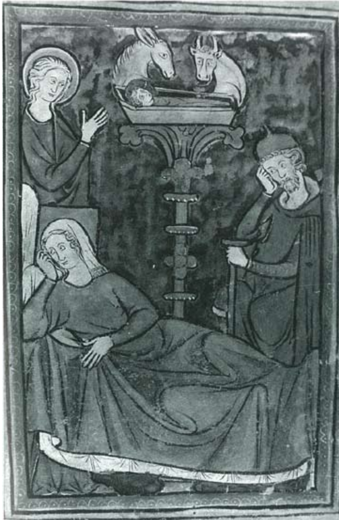
Figure 1: Nativity, Gothic Psalter, Hart Collection, Blackburn Museum and Art Gallery, Hart 2100, folio 1 recto (Camille 1989: 195)