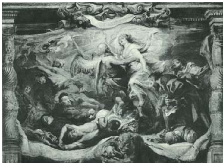
Figure 12: Peter Paul Rubens, The victory of eucharistic truth over heresy (1625-26). Oil sketch. Fitzwilliam Museum, Cambridge (Held 1980: 153, Cat 103)

eucharistic host is thematised by the Rubens sketch and, I am arguing, in Van Dyck's painting as well. Whereas Cranach's predella performs the religious authority of the Word and the inner presence of Christ in preaching and prayer through references to the brazen serpent, the sculptural representation of the hissing serpent in Van Dyck's painting looks just as alive as the flying serpents surrounding it. The dramatically animate serpent on the pole draws the attention to its presence, rather than to its representation as an image or sign.