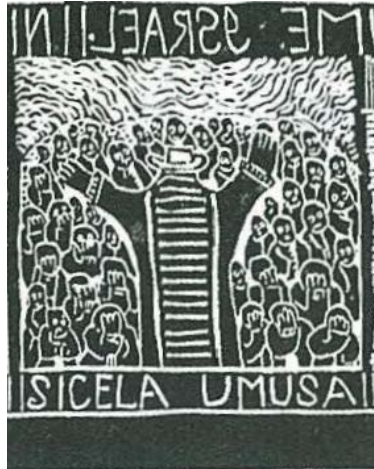
Figure 17: Azaria Mbatha, The story of Moses (1963). Scene 9: “We ask for mercy!” (detail). Linocut on paper. The Campbell Collections. University of Natal, Durban, (Durban Art Gallery 1998: 91)

Azaria Mbatha, on the other hand, wrestles with the crisis of cultural translation in his circumspect selection of particular scenes from the many episodes in the life of Moses, carefully relating them to Zulu anthropocosmic experience of copper (transfigured in the brazen serpent), thunder and lightning (associated with Moses' vision on Mount Sinai), water (the crossing of the Red Sea and water from the rock) and mountain (Mount Sinai). Mbatha depicts a process of translation or transfiguration, for example, of the mythic belief in the manifestation of the sacred through the power of thunder and lightning into the biblical belief of the progressive revelation of the God of history in the Heilsgeschichte (Figure 17).