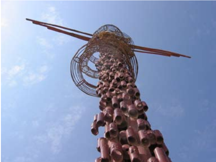
Figure 21: Giovanni Fantoni, Brazen serpent sculpture (detail). Mount Nebo, western Jordan < http://en.wikipedia.org/wiki/Mount_Nebo_(Jordan) >

and real image to appear. Images remain place holders for what one believes to be true.