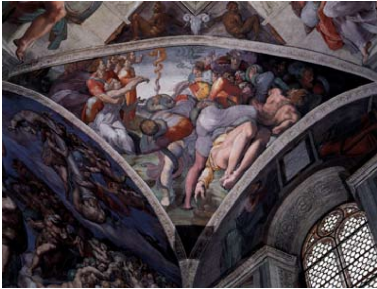
Figure 4: Michelangelo Buonarroti, , The brazen serpent (1511). Pendentive fresco, 585 x 985 cm. Cappella Sistina, Vatican, Rome (Web Gallery of Art < http://www.wga.hu/index1.html >)

theologian patrons. In the encompassing iconographic scheme of the ceiling the brazen serpent scene has a bridging and linking function (Figure 4). Its position close to the altar (Figure 5) as well as between the Old Testament ceiling frescoes and the New Testament last judgement scene behind the altar (Seymour 1972: 74) underscores its typological connection with the crucifixion. By contrast, the composition itself is characterised by the potency with which it segregates onlookers into distinctive groups. Its placement and composition together exhibit the distinctive capacity of division and mediation inherent to the topos .