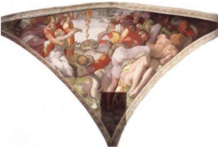
Figure 3: Michelangelo Buonarroti, The brazen serpent (1511). Fresco, 585 x 985 cm. Cappella Sistina, Vatican, Rome

The most popular art historical exemplum of the brazen serpent topos is Michelangelo’s fresco on one of the four relatively large pendentives of the Sistine chapel (Figure 3). This Renaissance representation exhibits what Aby Warburg called the dialectic of the interval (Warburg 1999, Rampley 2001) by means of which he described the processes of negation and preservation at stages of cultural change in the expectations of what constitutes an image.