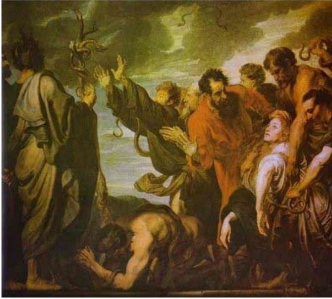
Figure 11: Antonie van Dyck (1599-1641), Moses and the brazen serpent , (1621). Oil on canvas, 205 x 355 cm. Museo Nacional del Prado, Madrid < http://www.artbible.info/art/large/143.html >

Isabella for the convent of the Descalzas Reales in Madrid (Held 1980: 153). Van Dyck entered Rubens's studio as an assistant in 1617 or 1618 and remained there until late 1620. The comparison reveals aspects of the contemporary battles of images. Rubens's cycle starts with four Old Testament pre-figurations of the eucharist – excluding the brazen serpent which was sometimes associated with Protestant art and was used, for example, on the title page of Calvin's Institutiones . In the subsequent allegorical sketch of the cycle, The victory of eucharistic truth over heresy (Figure 12), the luminous figure of truth steps on the dragon of heresy. An inscription hoc est corpus meum above her head associates truth with the mystery of the mass, and Calvin, represented with a scholar's cap and Luther, a fat monk, have fallen on the ground before her (Held 1980: 153). The alternatives of blindness to and visual recognition of the body of Christ in the