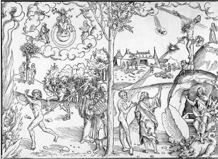
Figure 8: Workshop of Lucas Cranach the Elder, Law and grace (ca 1530) London, British Museum (Belting 2006: 184). Ca. 1535. Nürnberg: Germanisches Nationalmuseum (Belting 2006: 185)

For a number of years after the Reformation images were subjected to the new text culture to become mere sign systems. In a painting titled Law and grace produced by the workshop of Lucas Cranach around 1535 (Belting 2006: 184-5), a representation of the brazen serpent is strategically placed parallel to the representation of the temptation and fall on the left, and “in the shadow of” the crucifixion on the right. Such double images in which the law of the Old Testament is confronted by the grace of Christian religion became popular Lutheran Gedenkbilder – mental signs to gaze upon – and Zeugnissbilder – witnesses to aid memory (Michalsky 1993: 27). This painting was reproduced and circulated in print (Figure 8) as didactic treatises that must be read, like two pages of a book (Belting 2006: 184).