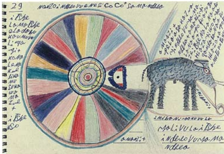
Figure 15: Laduma Madela, The powerful elephant after having opened the rock of rocks (sa) . Coloured pencil, pencil and ink, 26.8 x 18.8 cm (Schlosser 2002: 11)

The compelling image on the left of the poster repeats a drawing (Figure 15) in coloured pencil, pencil and ink made in a drawing pad of the “powerful elephant” opening the hollow half spherical “rock of rocks”. The blue and red contours around the rock, according to Madela, respectively designate the cold and lukewarm water surrounding the rock of origin, its heart. Inscriptions below the head and body of the elephant identify the blue and red stripes on either side of the opening as lightning bolts that had empowered the elephant to open the rock. The manner in which the appearance of the natural elements is depicted manifestly conveys excessive meaning. Madela’s rich rendering of the sheen of copper as multi-coloured concentric bands to which the eye converges suggests the plenitude of meaning of the mythical cosmos that makes Mveliqangi’s power immediately significant. Madela pictorially enhances the value of the durable metal to allow the transcendent to appear through it.