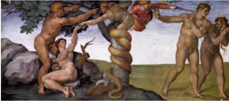
Figure 6: Michelangelo Buonarroti, The fall and expulsion from the garden (1509-10). Fresco, 280 x 570 cm. Cappella Sistina, Vatican. Rome

In the fall scene on the left, Adam and Eve's arms are extended towards the live serpent curled around the central tree of knowledge, repeating the gestures of the sinners seeking atonement from the copper image of the serpent, whereas on the right in the expulsion scene the palms of their hands ward the serpent off, repeating the gestures of those overcome by the fiery serpents. The two differentiated groups of spectators in the brazen serpent scene is thereby theologically linked respectively to the expulsion and its depiction of estrangement from God through sin in the presence of the serpent, on the one hand, and to the fall and its depiction of the promise of atonement and redemption through the coming of the Messiah which was first given directly after the fall, on the other.