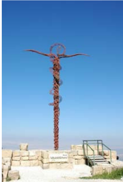
Figure 20: Giovanni Fantoni, Brazen serpent sculpture. Mount Nebo, western Jordan < http://www.panoramio.com/photo/4874646 >

The sculpture at first appears to be a substitute, repetition, prototype or reproduction of the original image, placed near its original site where the Israelites camped during their exile. The sculpture was visited by pope Jean Paul II in 2000 during his pilgrimage to the holy land which can be surveyed from Mount Nebo, and by pope Benedict XVI who delivered a speech there in May 2009. But the sculpture's displacement at a conflicted site where Moses, a patriarch of the Jewish, Islamic as well as Christian religions is believed to have viewed the promised land that he could never enter, and where he is believed to have died and been buried, soon makes the spectator aware of the ironies of the central value that the Other assumes in conceptions of the self in postmodern society. Aleida Assmann (1996: 99) points out that "[t]he period of postmodernity is characterized by the fundamentalization of plurality". Yet, she continues,