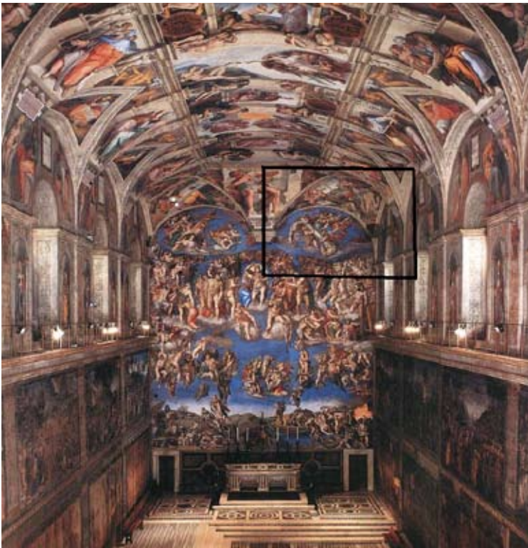
Figure 5: Michelangelo Buonarroti. Ceiling frescoes (1508-1512) and Last Judgement (1537-41). Cappella Sistina, Vatican, Rome

central axis that seems to strike into the space of the spectator. The group of flying serpents resembling lightning strokes, at the back of the picture plane, draws attention to a virtual axis commenced by the representation of the ruddy copper serpent, and dramatically extends into the excessively foreshortened figure of the male figure who is overpowered by a greyish muscularly animate serpent in the foreground, dividing the spectators in two distinctive groups. In this respect the composition corresponds with the ceiling fresco of The fall and expulsion (Figure 6) which flanks the central ceiling fresco.