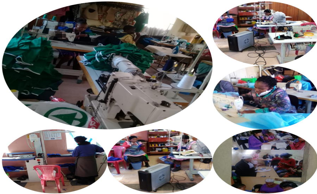
Figure 4.1: Sewing Projects Cooperatives