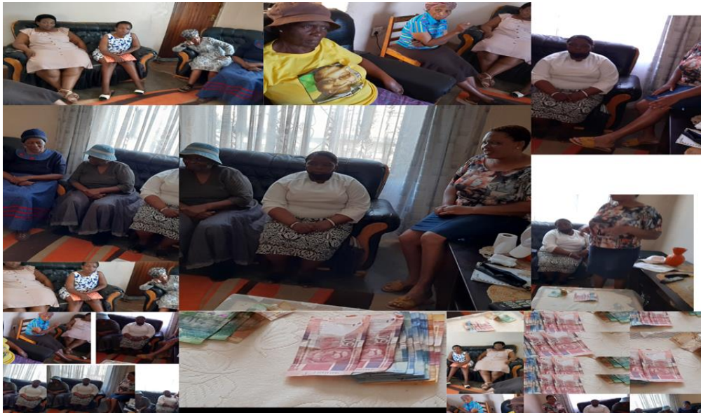
Figure 4.3: Street burial stokvel

20 rand (fixed figure), the money is given to the member in the family then the member will decide what to buy, we do not necessarily determine for the member what to buy.