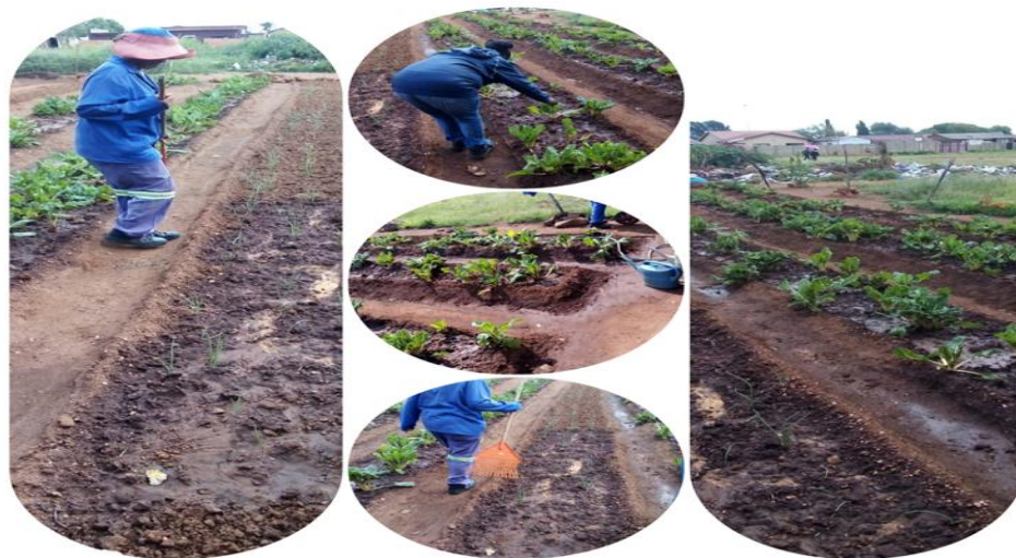
Figure 4.2: Basadi Tsohang Gardening Project

The project focuses on planting vegetables, such as spinach, cabbage, green peppers, and potatoes. Members sell their produce to the community and they have a stable clientele that comes every Wednesday to purchase vegetables. They also make deliveries to regular clients as per orders. Their future dream was to get into big markets and to approach big retailers like Pick n Pay to make an agreement to produce for them. According to the participants, the local community members love their produce and place orders every day.