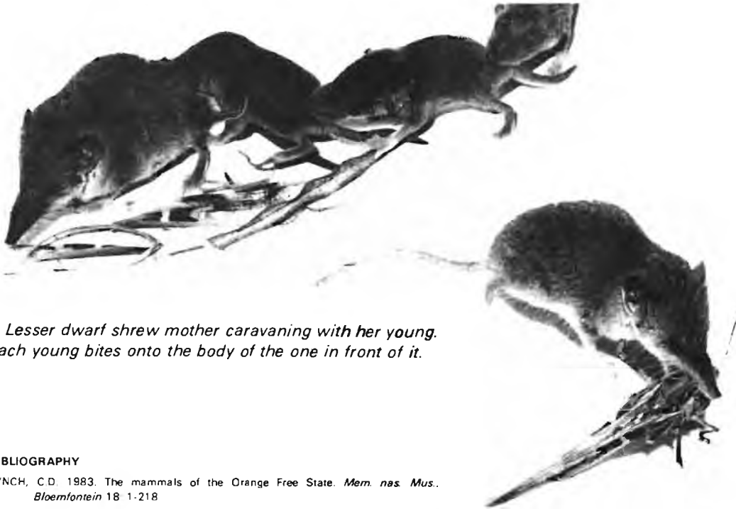
A Lesser dwarf shrew mother caravanning with her young. Each young bites onto the body of the one in front of it.