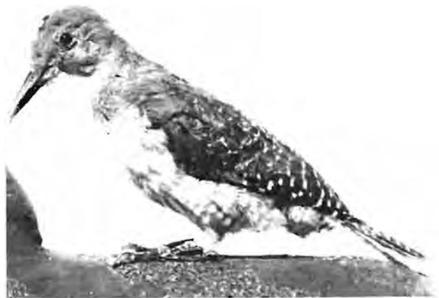
Die Grondspeg, 'n voël wat uitsluitlik van miere leef.