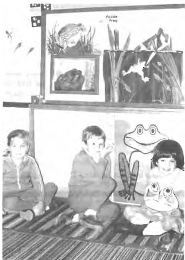
A frog showcase in the background with some toddlers and their impressions in front.