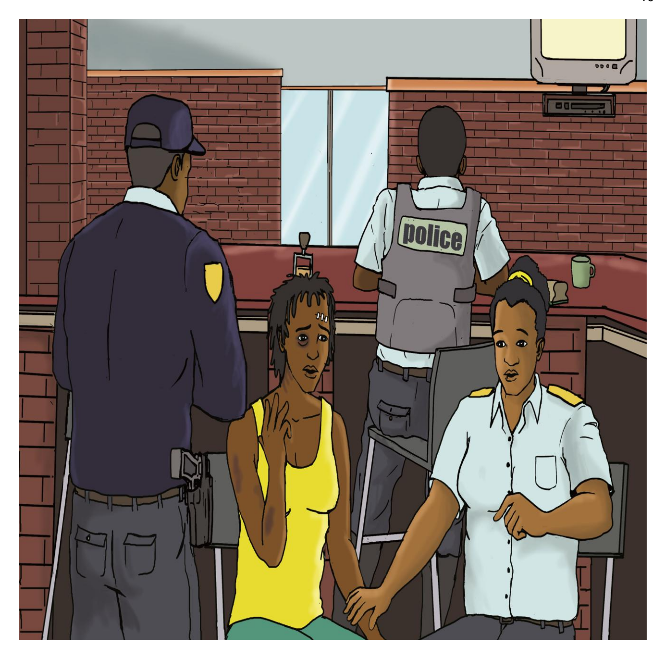
Figure 2 An artistic image drawn by a professional graphic designer (on the researcher's request) at one of Khayelitsha's police stations (in Cape Town, Western Cape), depicting police officers ( transpreters ) attempting to obtain information related to the criminal activity.