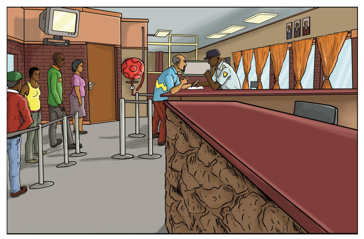
Figure 2. An artistic image drawn by a professional graphic designer (on the researcher's request) at one of Khayelitsha's police stations (in Cape Town, Western Cape), depicting the physical environment of a police station, and the manner in which members of the public have to interact with the police offices ( transpreters ).

assigned to the transpreter is – amongst others - to raise questions, based on the institutional frame of reference, that are supposedly crucial for purposes of record reconstruction and for the benefit of the investigation. The suspect or witness is obliged to comply and contribute to the interaction by responding to questions and furnish the necessary detail as and when required. On the basis of this reality, it could be argued that the authority structure of the charge office or police station have some effect on the institutionality of the discourse (a matter discussed in some detail by Haworth 2009).