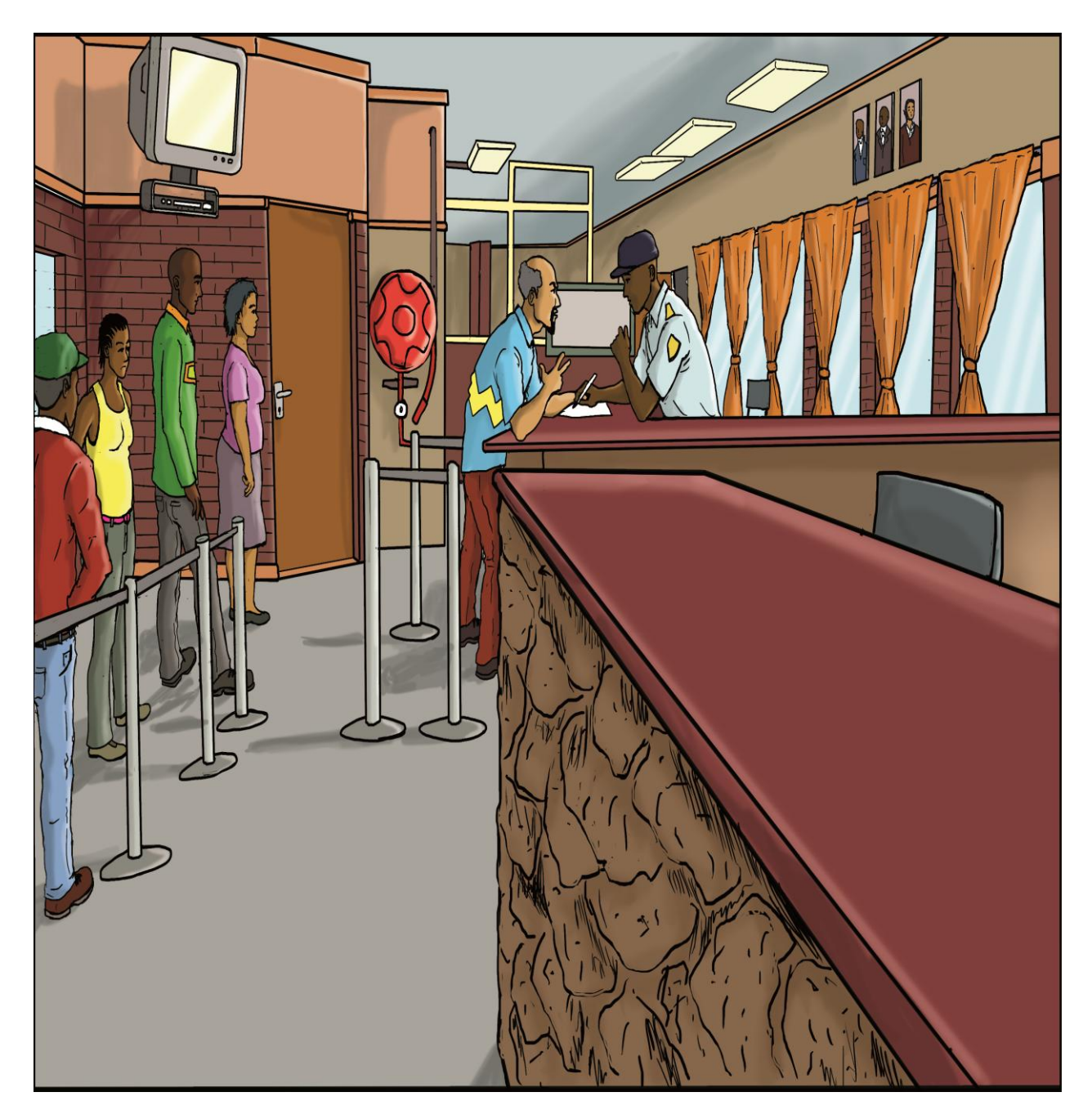
Figure 1 An artistic image drawn by a professional graphic designer (on the researcher's request) at one of Khayelitsha's police stations (in Cape Town, Western Cape), depicting police officers ( transpreters ) sitting behind the counter during an information exchange with a member of the public.

opportunity into further studies within the South African context in as far as police record construction is concerned.