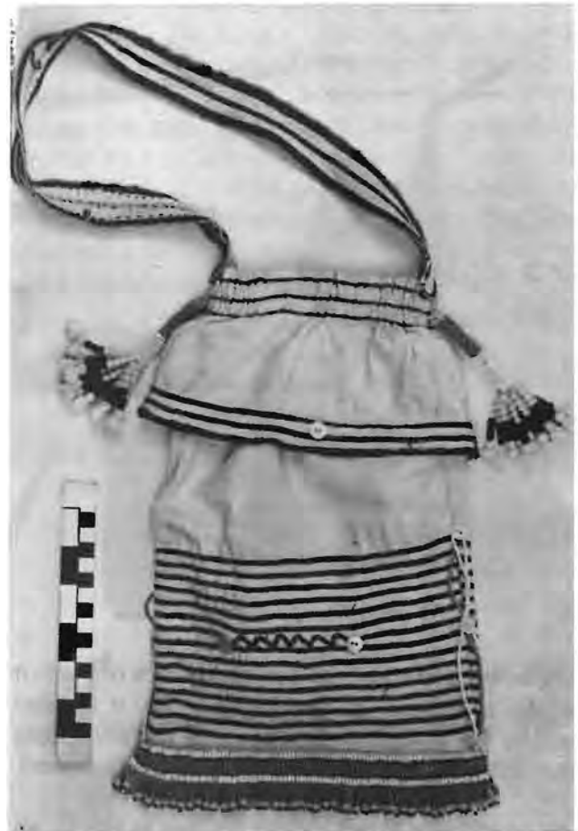
Decorated cloth smoking 'pouch'.

Traditionally tobacco plays an important part in the lives of the Bantu-speaking peoples. It is not only smoked, but is ground and mixed with some type of charcoal, such as burnt prickly pear leaves, to make snuff. In some areas it is still used mainly as snuff rather than for smoking. Most adult males smoke and/or use snuff, either snuffed up the nose or placed under the lip. In some groups the men are more inclined to smoke while the women are more inclined to take snuff. Among the Pedi, tobacco is taboo to a woman until she is past child-bearing age, but she may take snuff, which is considered to be a remedy for headache, toothache and nosebleed.