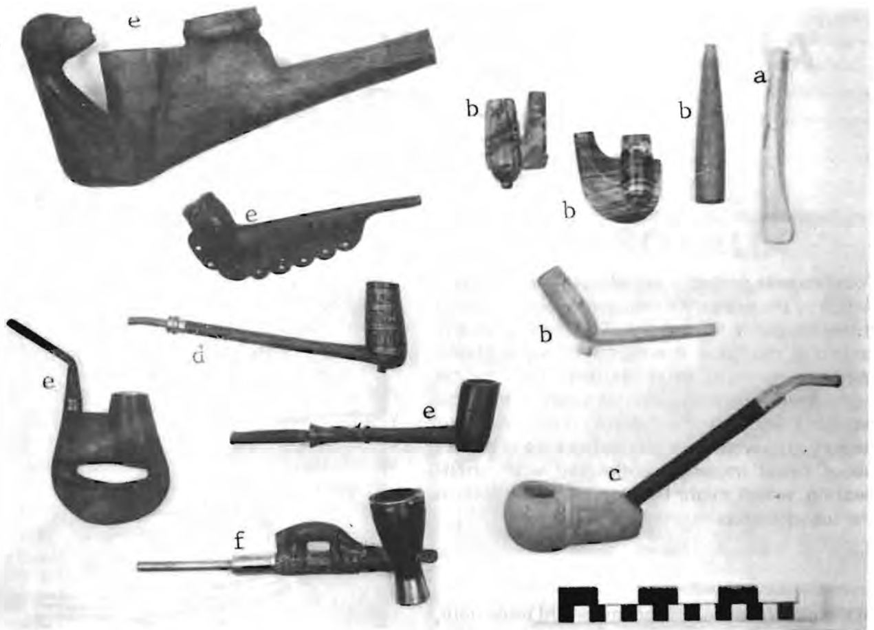
(a) simple bone pipe