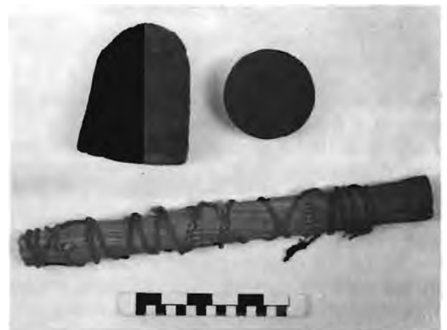
Items of trade: a moulded block of tobacco, a ball of tobacco, and a roll of tobacco wrapped in matting.

Among some groups there is a special etiquette involved in giving and receiving snuff. There are special formulas for asking for snuff and polite ways of receiving it, as well as rules deciding who may give or receive it. No man may ask another man's wife for snuff in case it contains magical charms that may harm him. For the same reason it is considered dangerous to accept snuff from a stranger.