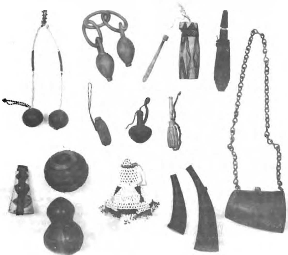
Snuffboxes made from a variety of materials

The simplest pipe was a short piece of decorated bone. Pipes, beautifully carved from stone were used by the Khoi, San, Tswana and Herero. A type of pipe modelled on the old-fashioned European pipe had a rough stone or clay bowl. In Lesotho mealie cobs were hollowed out to make pipe bowls. Pipes are also carved from wood, often decorated or shaped in human or animal forms, and sometimes inlaid with metal or bone. Metal pipe bowls are also found. Today the wooden European pipe often replaces the more elaborate traditional pipes. Among the Cape Nguni, e.g. the Xhosa, Mpondo, etc., women smoke long-stemmed pipes, often decorated with beadwork. The higher a woman's status, the longer the stem of her pipe. Men's pipes have shorter stems. Smoking is usually a communal activity. A pipe may be passed around and it is a matter of good manners to share the little tobacco one may have. There is also no embarrassment involved in asking for tobacco