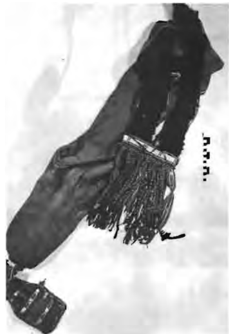
Smoking 'pouch' made from a whole goatskin.

Snuffboxes are numerous and varied, made from a variety of material such as horn, wood, cocoons, small gourds, small tortoise shells and, in recent times, tins and glass bottles. They are often decorated with carvings or burnt etchings or covered with beadwork or wirework.