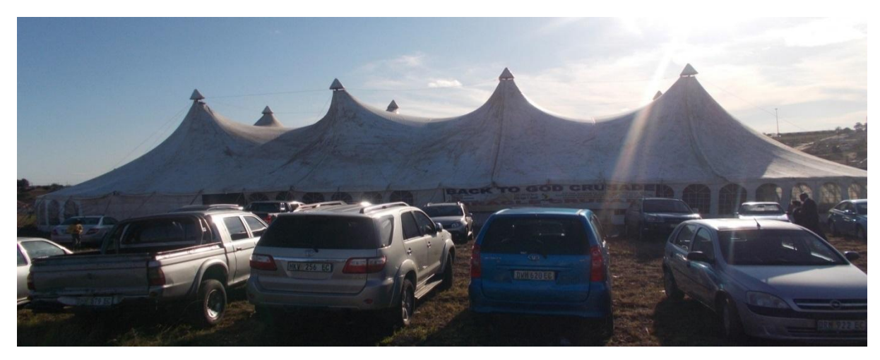
AOG Platinum Jubilee Celebration - 70 years since the AOG was instituted