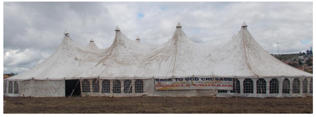
Erected on 13th of September 2015 at Mdantsane Township – 39 years after Bhengu's death