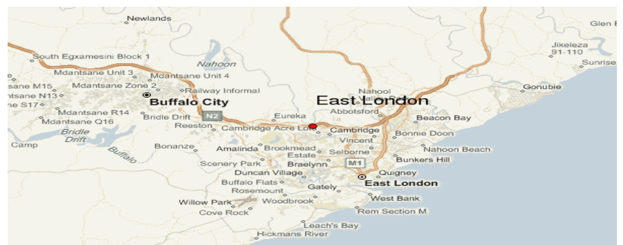
Map of Mdantsane – Mdantsane NU13, Mdantsane NU2