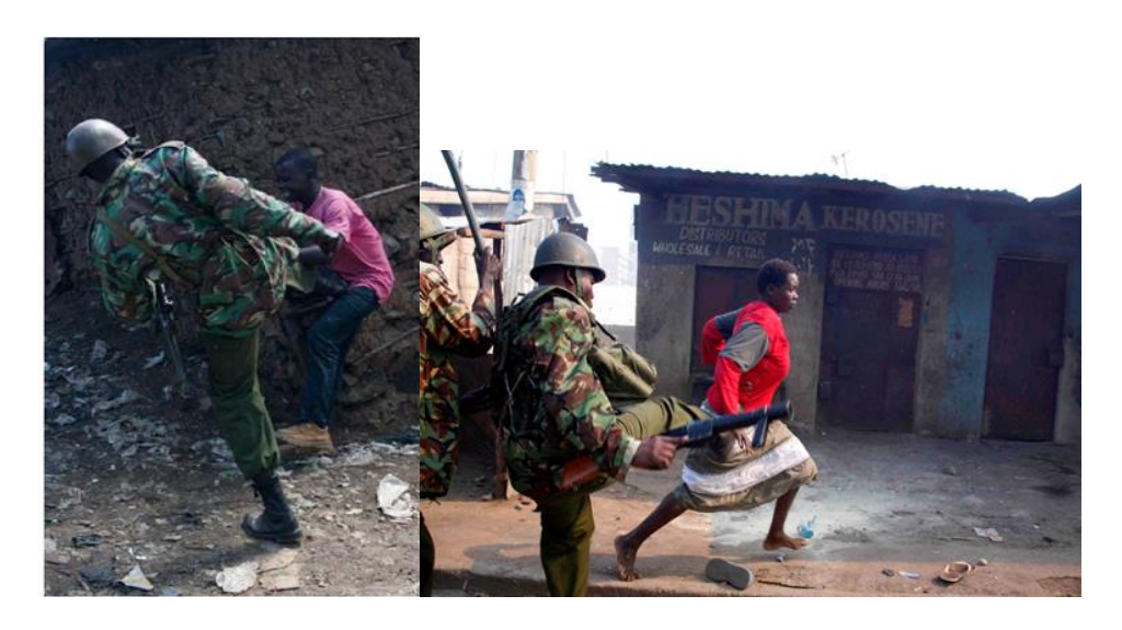
Figure 17.604 Police sent in to keep order in the post-election violence.

Along with the strident criticism of politicians for inciting electoral violence, the following images – Figures 18 to 19 – highlight Mwangi's confrontations with the political elites when they fail in their obligations, many of whom attain office through blood and death. In the images below, taken in May 2014, Mwangi leads other activists in a protest inspired by George Orwell's Animal Farm . They used the allegory of Orwell's predatory pig oligarchy to indict Kenyan parliamentarians, on a day that they sought to increase their monthly salaries to a rate that was 131 times Kenya's minimum wage. <sup>605</sup> The chant "MPigs", next to piglets covered in blood symbolised the voracity of Kenyan parliamentarians that feed off the blood of the subjects.