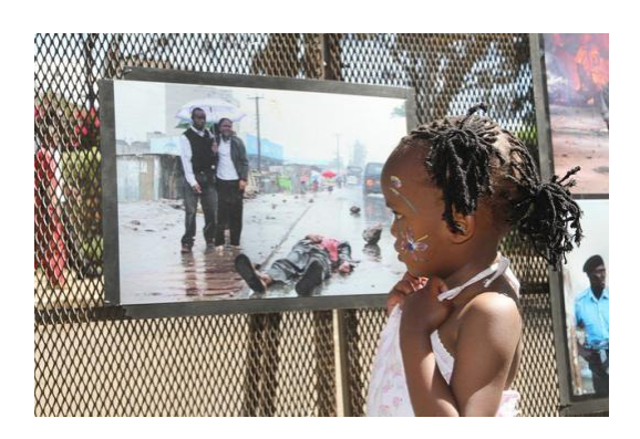
Figure 20.<sup>608</sup> The public exhibition of Mwangi's post-election images. The government shut down one of the main exhibitions in 2012, claiming it was causing tension.