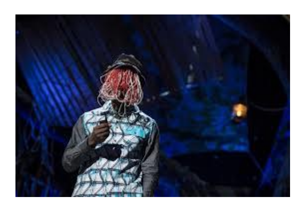
Figure 9.<sup>578</sup> This is an image of Anas during his TED Talk presentation in 2013, wearing his most familiar mask.

As described by most commentators, Anas is Ghana's most prominent or "best known but least recognisable journalist". <sup>579</sup> As a custom, Anas begins all his presentations with the disclaimer that he cannot show his face. He must safeguard his anonymity as it is an important weapon for his work. The other important reason for this gesture, as he stated at the beginning of his TED talk in 2013, is that "bad guys will come at me". Over the years, his use of different disguises has not only generated an air of mysticism around his person, but has also produced a sense of