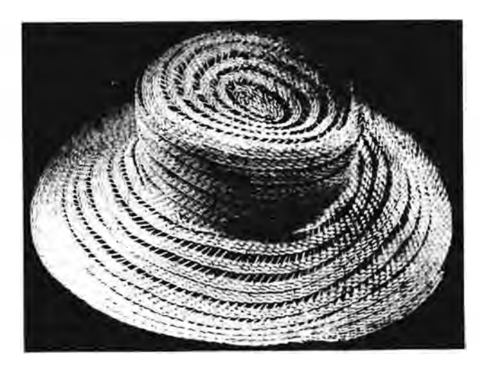
This hat is commonly known as MOSETLA, but it is more precisely the wider brimmed MOKOROTLO.