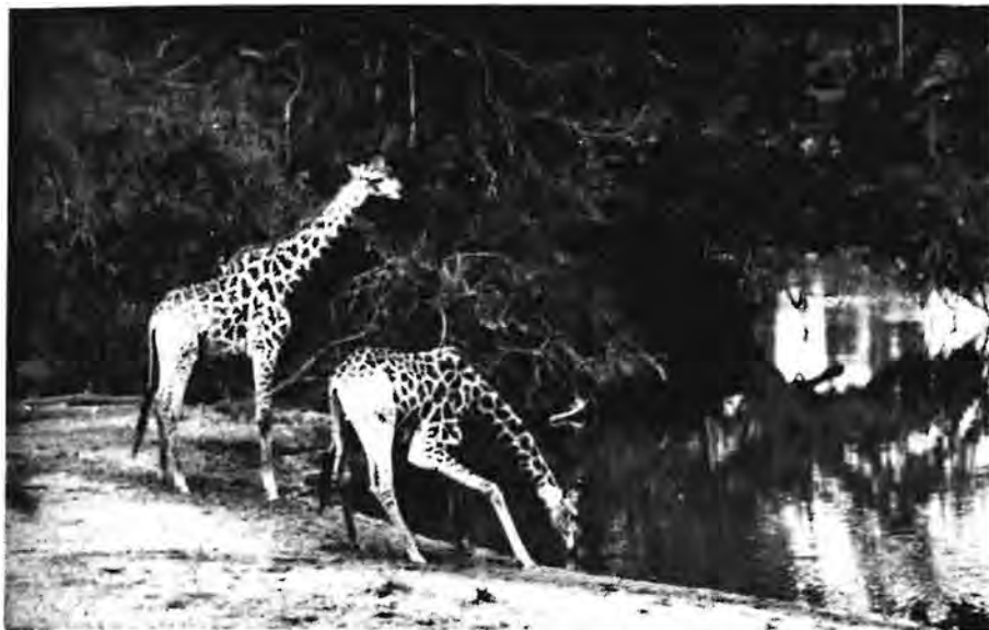
Giraffes in the Kruger National Park.

To give but one example: A hundred years ago the world-famous microbiologist, Louis Pasteur, discovered the process by means of which micro-organisms can be eliminated. Even today we pasteurize our milk. But the discovery