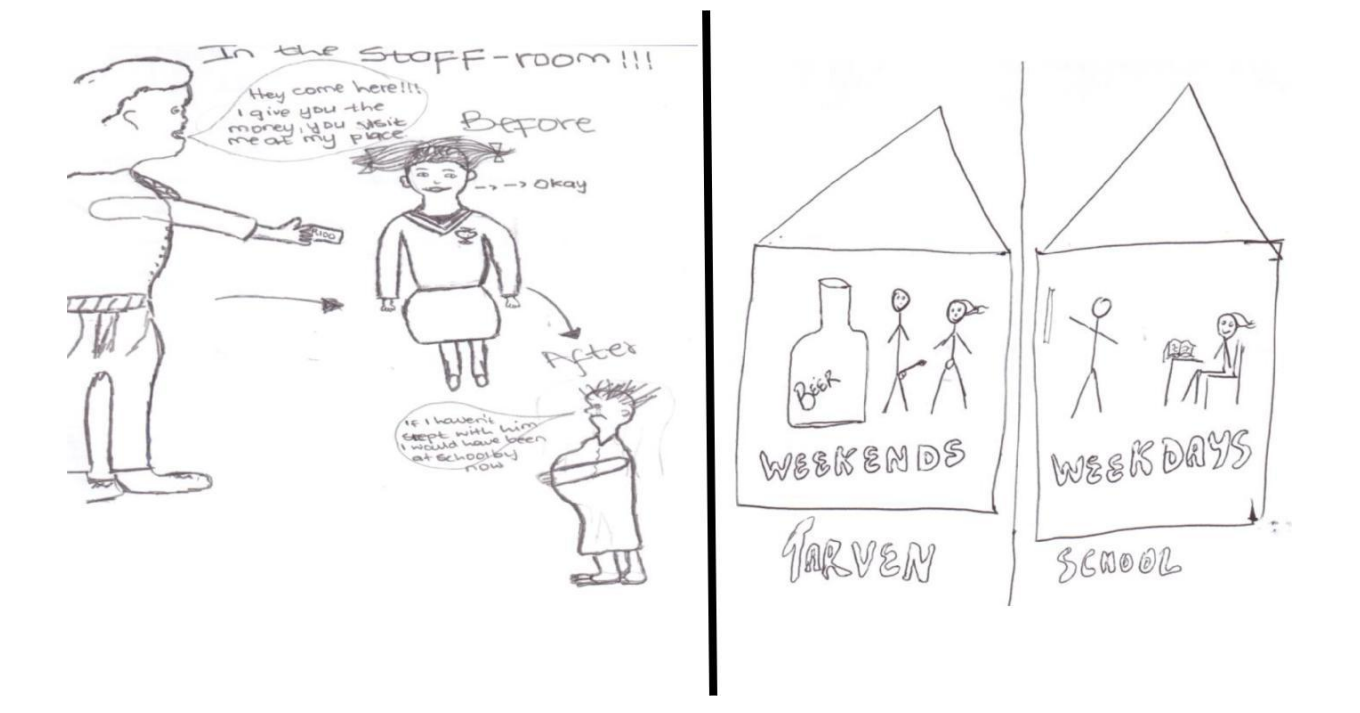
Figure 1: Sexual relations with learners

Figure 1 portrays a teacher who gives money to a school girl as bribery for sexual affairs, as well as a teacher who spend time with school girls in the tavern drinking and sleeping together. It is a concern to see that there are some teachers who portray the attitude of seeing school girls as potential lovers. This attitude is fuelled by African traditions of patriarchal structures which forbid women and children from discussing sexual matters. Women and children are treated as property of men; a view which serves as a universal code of sexual misconduct (Masehela and Pillay, 2014). One female learner submitted the drawings of her teacher who bribed a peer for sexual favours in the staffroom. It was confessed during informal chatting before leaving the room that it is a fruitless exercise to report a teacher because they always have a way out.