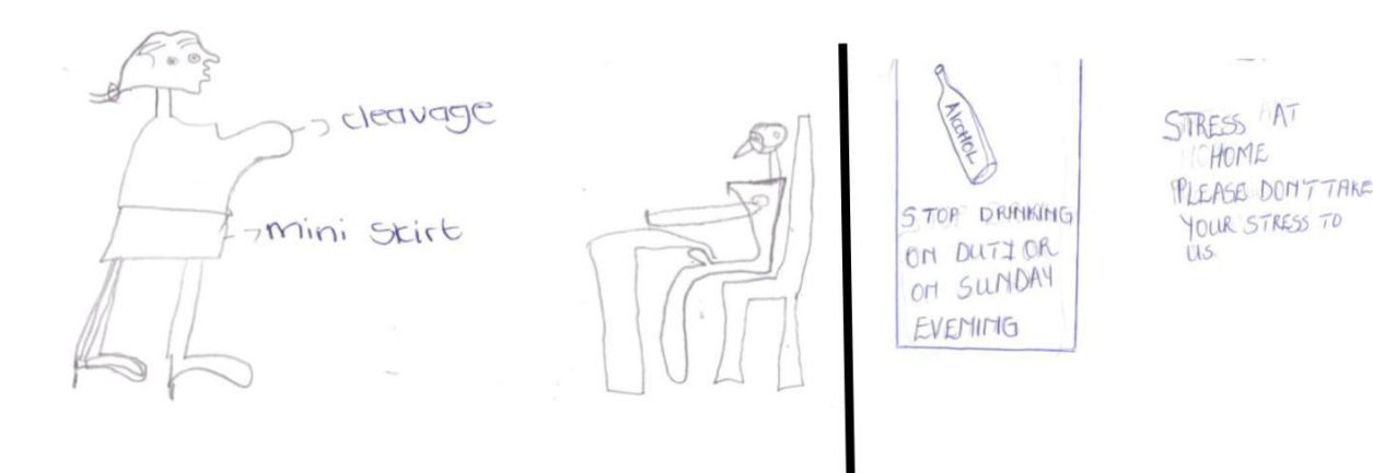
Figure 2 depicts the dress code of a female teacher that invokes sexual fantasy on the male learner, while another drawing suggests that there are some teachers who go to school while under the influence of intoxicants. A study by Beyers (2012), which was intended to narrow