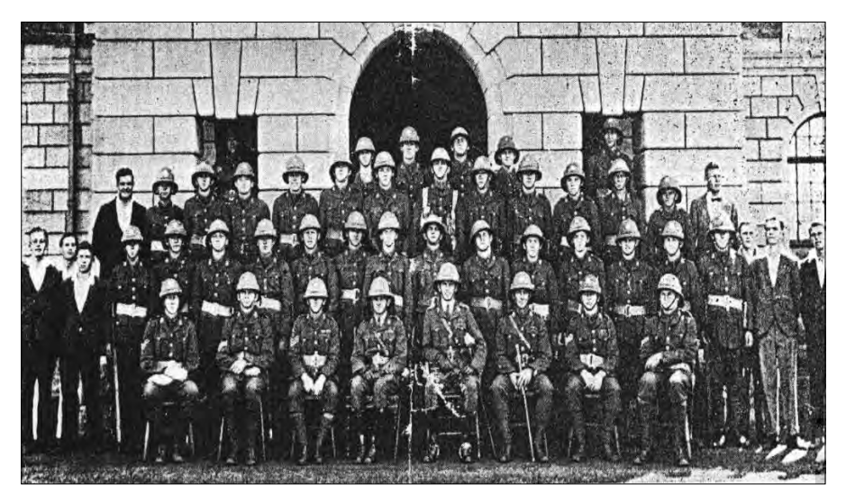
FIGURE 3: No 2 Field Company, Pretoria, [1926].

Instead of establishing the units at practical locations as the Clarke Committee had suggested, Defence Headquarters succumbed to the idea of an engineer unit at each provincial capital. However, practicalities were to show that this did not work. Within six months of the establishment of No.1 Field Troop, the unit had to be transferred to Durban in view of a very poor response to the call for personnel in Pietermaritzburg. Durban had a larger population and the greater industrial activity offered a far better chance of forming and training a useful unit. Durban had been the obvious choice from the start.