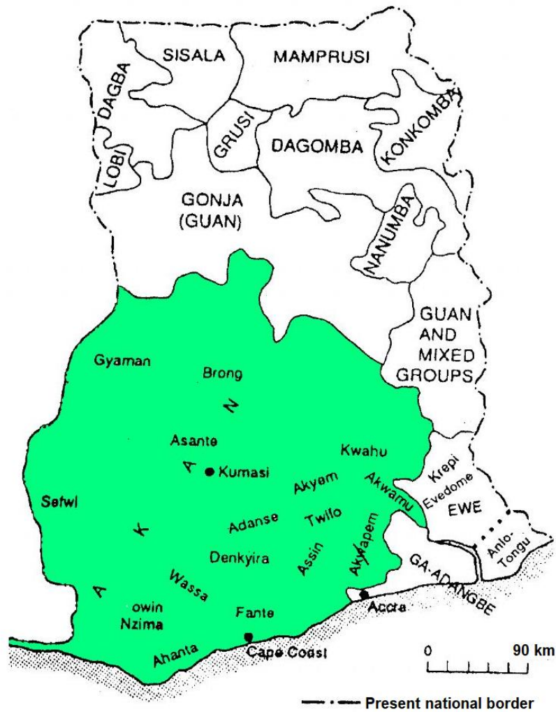
Fig. 5.1 The map of Ghana

population. The map below depicts the Akan dominance in Ghana's geography and population. 7