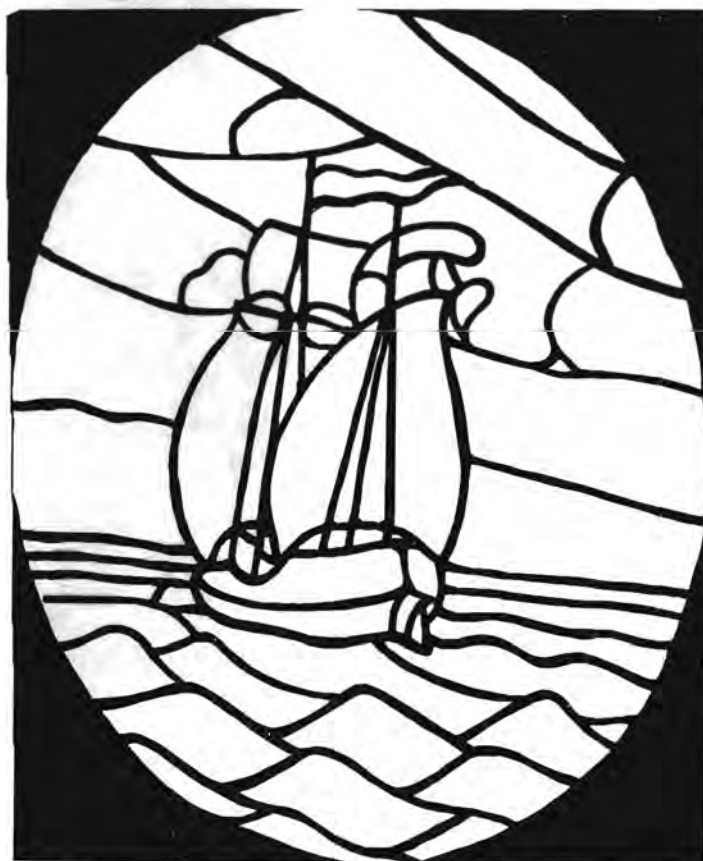
'n Kleurglasvenster van die Grand-teater wat behoue gebly het. Daar was een aan beide kante van die hoofingang.

Daar is nog heelwat Bloemfonteiners wat toneelopvoerings en rolprentvertonings in die ou Grand bygewoon het. Indien daar lesers is wat beskik oor enige interessante inligting omtrent die Grand-teater of miskien foto's besit, kan u gerus met die Museum in verbinding tree. Bestaan daar nie dalk iewers 'n foto van die foyer van die teater nie?