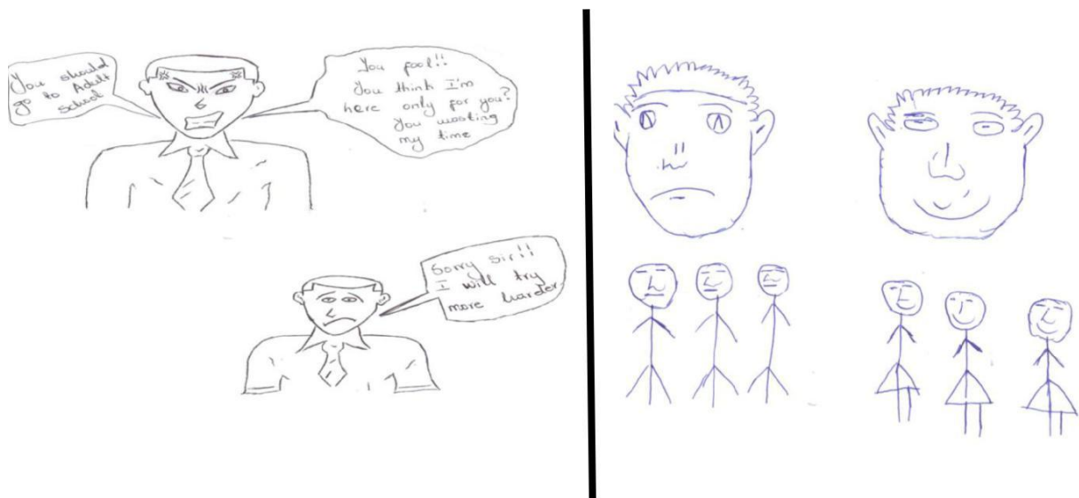
Figure 3: Spoken words and facial expressions of teachers

Brown (2013) compared role-modelling of teachers with role play. Brown explained that role-play helps to constitute one's personal front stage which is the overall impression that one presents to others when interacting with them in any specific situation. Brown stated that facial expressions and bodily gestures affect how people see and judge others in society. Teachers should try their level best to use facial expressions and bodily gestures which promote equality and non-prejudice rather than favouritism. Naeem and Iqbal (2011) stated that facial expression results from one or more motions or positions of the muscles of the face.