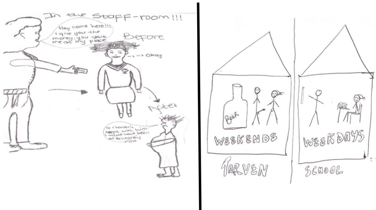
Figure 1: Sexual relations with learners

Figure 1 portrays a teacher who gives money to a school girl as bribery for sexual affairs, as well as a teacher who spend time with school girls in the tavern drinking and sleeping together. It is a concern to see that there are some teachers who portray the attitude of seeing school girls as potential lovers. This attitude is fuelled by African traditions of patriarchal structures which forbid women and children from discussing sexual matters. Women and children are treated as property of men; a view which serves as a universal code of sexual misconduct (Masehela and Pillay, 2014). One female learner submitted the drawings of her teacher who bribed a peer for sexual favours in the staffroom. It was confessed during informal chatting before leaving the room that it is a fruitless exercise to report a teacher because they always have a way out.