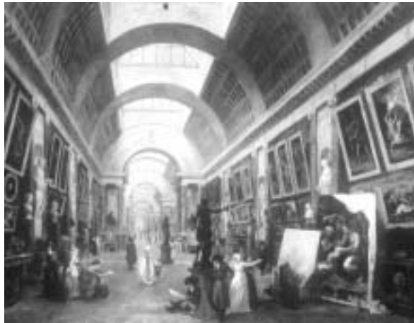
Figure 3: Hubert Robert (1733-1808), Project for the disposition of the Grande Galerie, Louvre (1797). Paris: Musée Louvre

absence of measures to relativise the colonising effects of the museum frame, the Bushman legacy was to become the victim of the very project launched to celebrate it as a national heritage site for the construction of a new multicultural national identity and future.