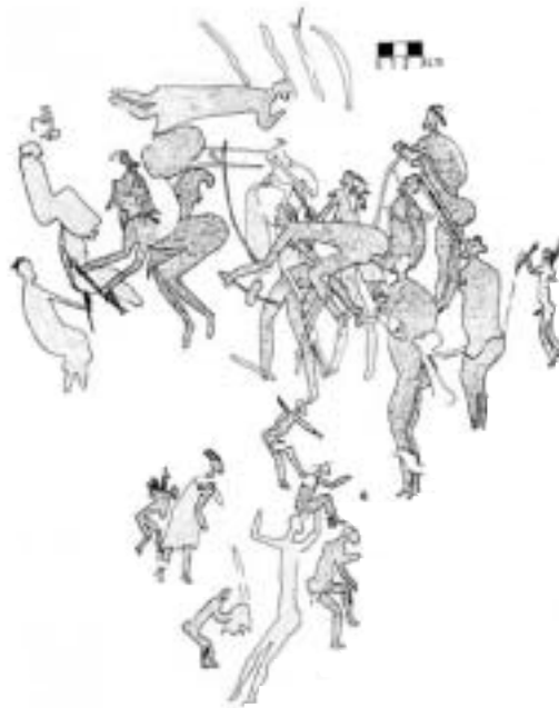
Figure 12: Copy of the tracing of Cluster 5 from Panel 4: the trance dancing women (Loubser 1993: 366)

Reading the prancing, crouching, rising and floating figures in Figure 12 as a single action or narrative episode, the variety of scale, movement, posture and action evokes successive stages of shamanistic transformation. As a strategy of visual narration, formal variation