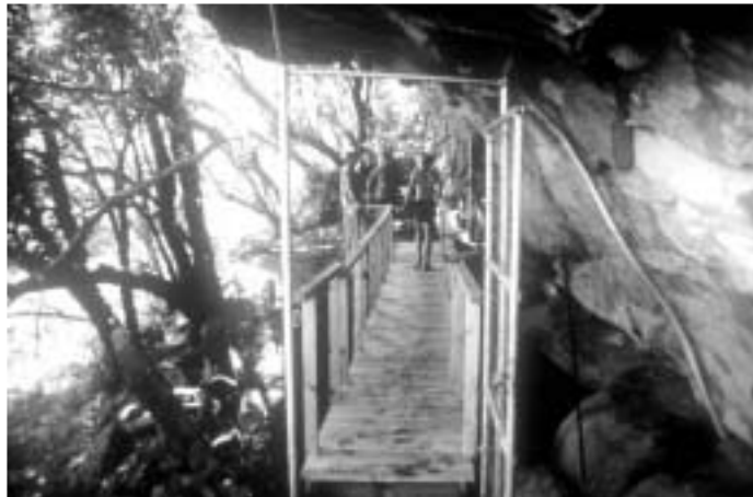
Figure 1: Photograph showing the wooden boardwalk and handrail installed in the Tandjesberg shelter, creating an open-air museum

The “before” photograph of Tandjesberg records the shelter transformed into a picture gallery (Figure 1). It shows an existing place being put to new use as a public display space and a tourism resource,