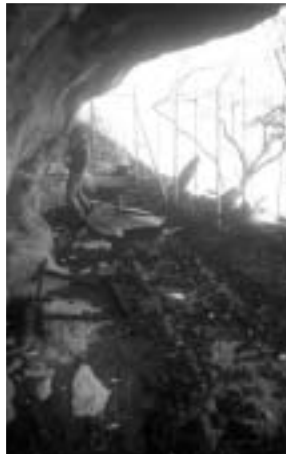
Figure 5: Photograph recording the veldfire damage to the Tandjesberg shelter, taken on 25 September 1998