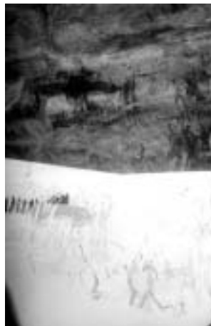
Figure 7: Photograph showing a paper version of Panel 10, Cluster 2, copied from tracings on acetate sheets, displayed in front of the original rock face (National Museum, Bloemfontein)