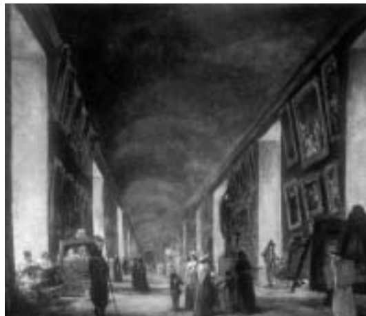
Figure 2: Hubert Robert (1733-1808), The Grande Galerie of the Louvre (1794-6). Paris: Musée Louvre