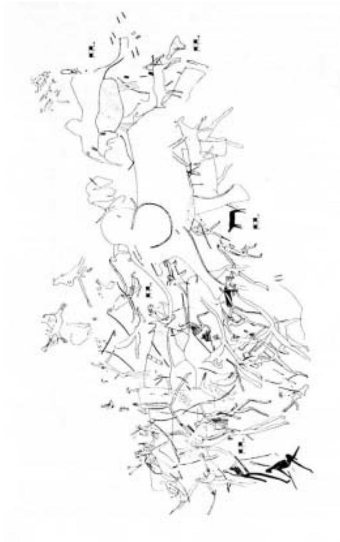
Figure 8: Copy of the tracing of Panel 2 showing the elephant hunt scene (Loubser 1993: 356)