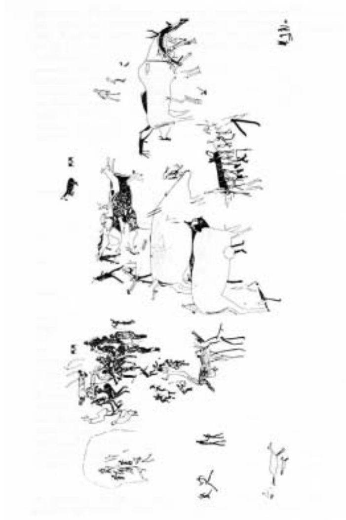
Figure 11: Copy of the tracing of Panel 4, showing the configuration of the trance dance group with eland, rhebok, rain-animal, theiranthropes and the final addition of wild dogs (Loubser 1993: 364)