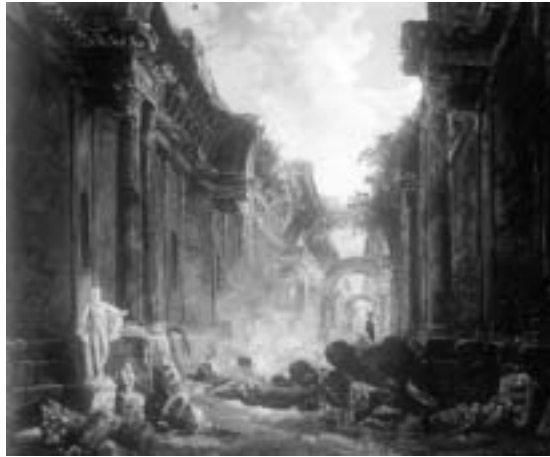
Figure 4: Hubert Robert (1733-1808), Imaginary view of the Grande Galerie as a ruin (1798). Paris: Musée Louvre