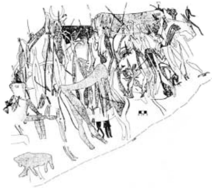
Figure 10: Copy of the tracing of the mythic vision in Panel 9 (Loubser 1993: 376)

Take for instance Panel 9, located in an alcove-like recess in the rock face. A copy of the tracing gives us some idea of this intricate image cluster of eland, humans and theiranthropes (Figure 10). Formally, it does not conform to classical compositional rules (cf Kuhn