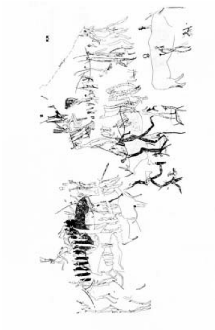
Figure 13: Copy of the tracing of Cluster 2 from Panel 10: the row of ancestral figures (Loubser 1993: 364)