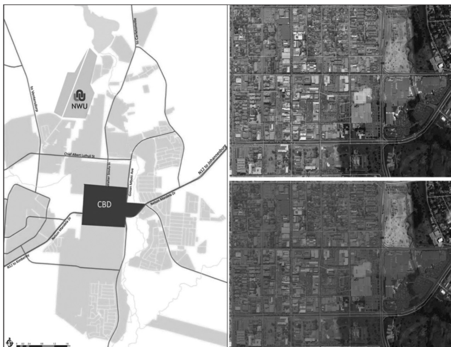
Figure 1(b): Study area: Potchefstroom Central Business District