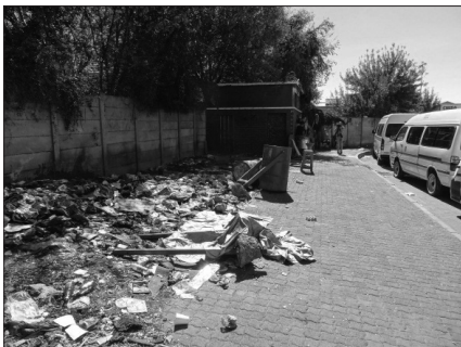
Figure 4: Examples of urban decay

and pedestrians. At the time of the observations, the built environment showed signs of urban decay (see Figure 4), such as a lack of maintenance (presence of litter and broken sidewalks), vandalism (broken windows and graffiti), and a visible consciousness of crime (illustrated by target-hardening security measures, such as fencing on building roofs, bars in front of windows, Closed Circuit Television Cameras, and alarm systems). The physical space has almost no greenery (trees and shrubs).