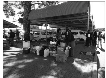
Figure 5: Examples of social interaction (pro-social behaviour)