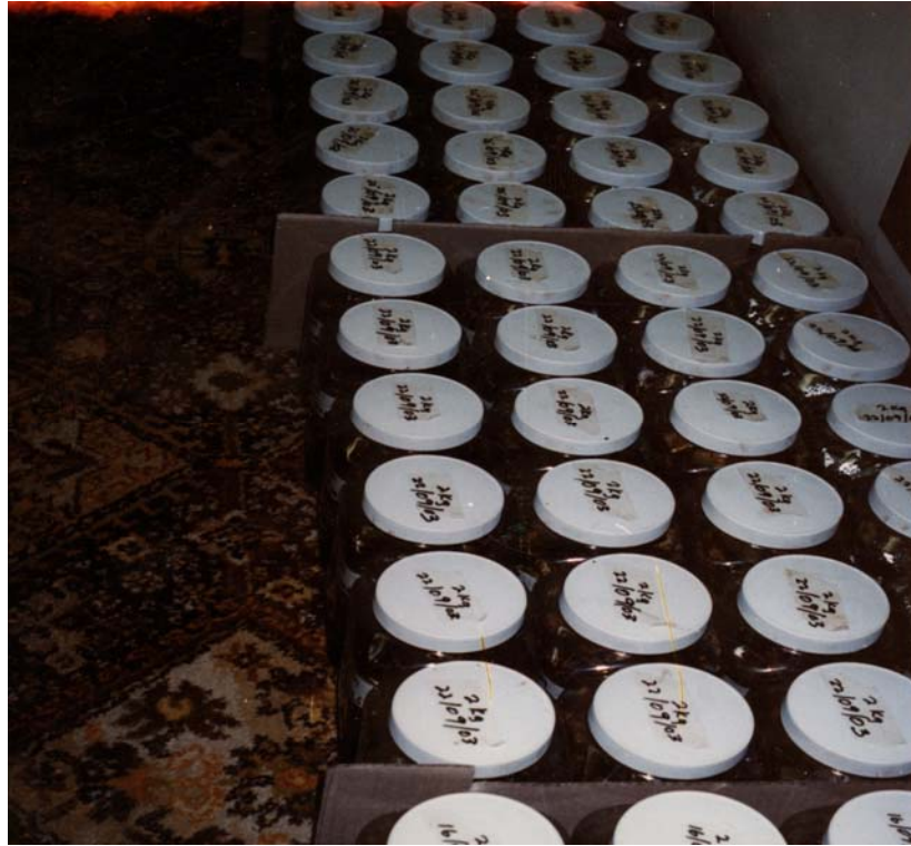
Figure 4.3 - Plastic bottles with ensiled cladodes