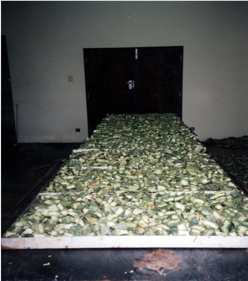
Figure 4.1 - Fusicoulis cladodes cut into 20mm square pieces