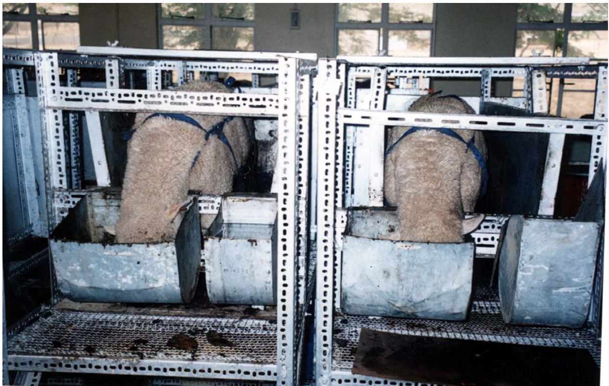
Figure 5.2 - Sheep metabolism crates

Twenty-four young Merino wethers were randomly divided into 4 groups of 6 each. The animals were weighed after a 12 hour fasting period and put in individual metabolism crates (Figure 5.2). The food was daily given at ad libitum at 8h00 to each sheep. Refusals and feaces were collected daily at 8h00. The refusals were weighed again to determine the amount of feed consumed by sheep per day and the feaces was also weighed and dried for analysis. The experimental period consist of a 7 day adaptation period and 18 day intake study. A collection period during the last 10 days of the intake study was implemented. The sheep were weighed again after a 12 hour fasting period at the end of the experimental period.