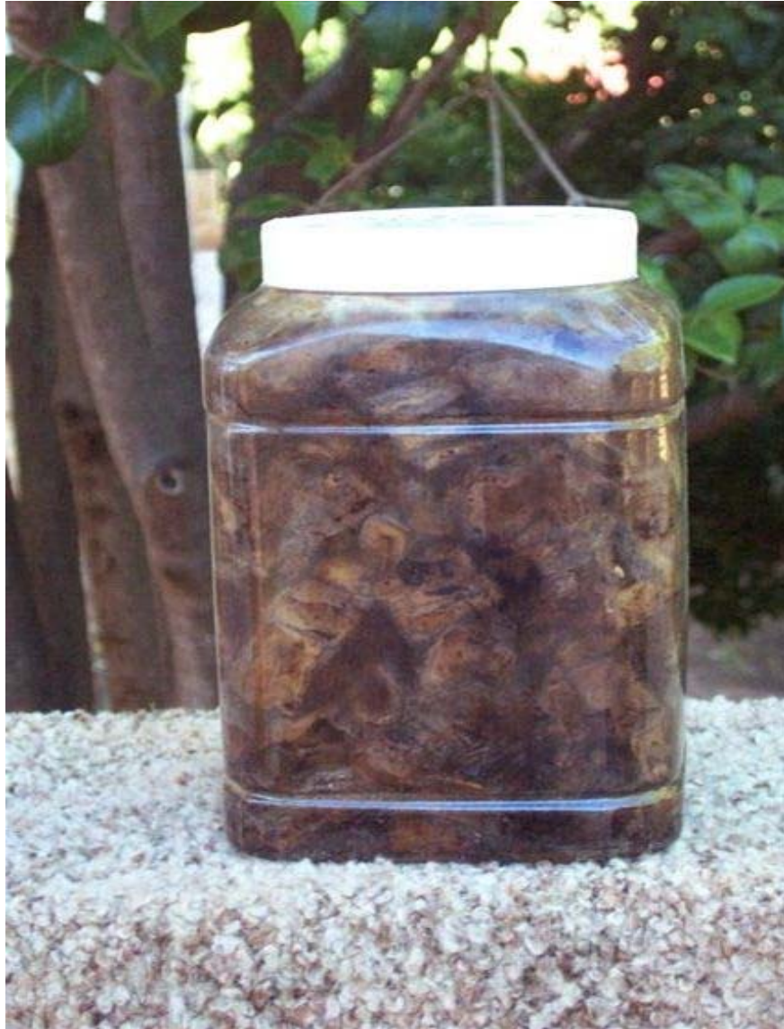
Figure 4.2 - Ensiled Fusicoulis cladodes