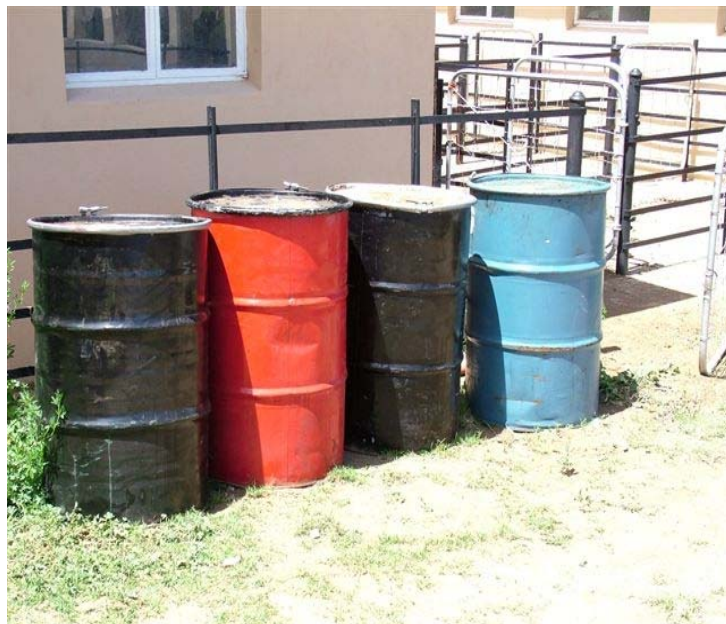
Figure 5.1 – Metal drums with ensiled cladodes

Fasicaulis cladodes (one year-old) were harvested in March 2005 at Grootfontein experimental farm, Eastern Cape Province, South Africa. These cladodes were cut into 20 mm square pieces using a sharp knife. The same procedure as in Chapter 4 was followed. Fusicaulis pieces were sun-dried to obtain two levels of dry matter (DM) namely 30 and 40 percent. Two levels of molasses powder (Kalori 3000) namely 0 and 24 percent on a dry matter basis were implemented. The 24 % molasses was added and thoroughly mixed with the plant material in each dry mater level. Each mixture was put in a 200 litre plastic bag in metal drums, tightly packed and air tightly sealed (Figure, 5.1). The material was ensiled for a period of three months before opened and fed to sheep.