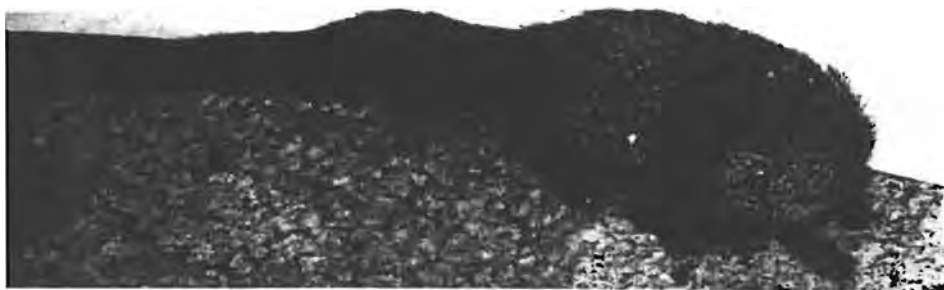
Grey mongoose Grysmuishond

However, current research on the grey mongoose shows that of the six subspecies only three forms are valid, namely ruddi ,