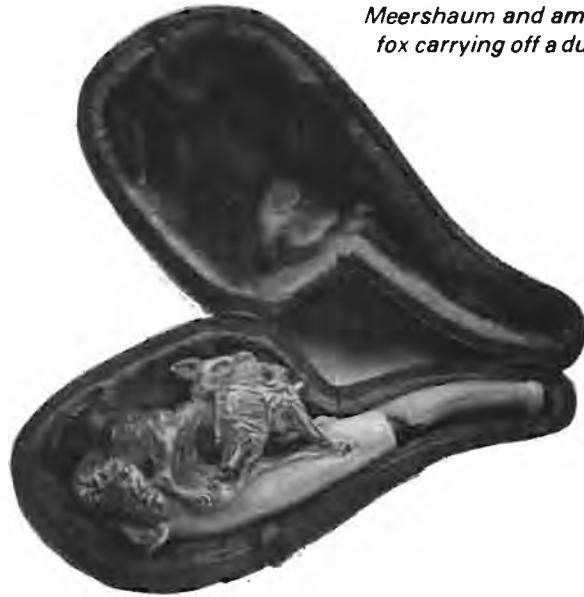
Meerschaum and amber pipe of a fox carrying off a duck in a case.